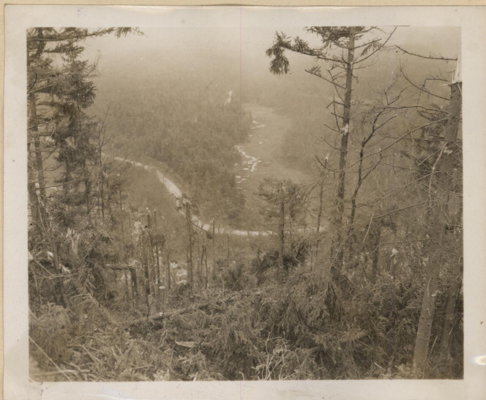
SCENE ALONG ROAD TO HURTGEN BEHIND THE 8TH DIV.

Sheet 1 of 6 sheets to Inclosure No. 5, AFTER ACTION REPORT December, 1944