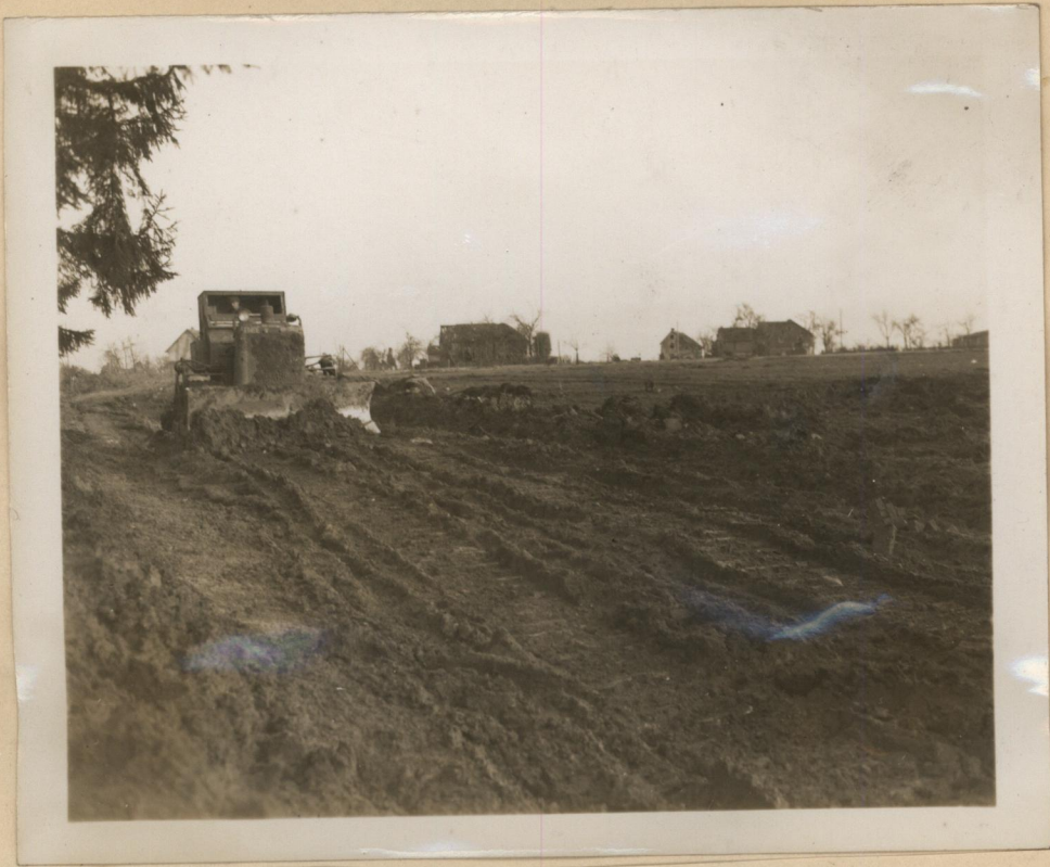
GERMETER - THIS ROAD LED TO VOSSENACK OR HURTGEN. "A" COMPANY PERFORMED DIFFICULT MAINTENANCE. BUILDINGS IN BACKGROUND LAID AS BASE FOR ROAD.