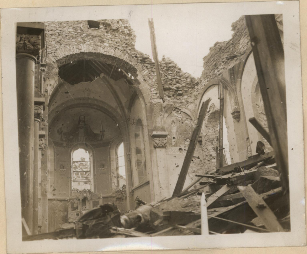
CHURCH IN HURTGEN

Sheet 3 of 6 sheets to Inclosure No. 5, AFTER ACTION REPORT December, 1944