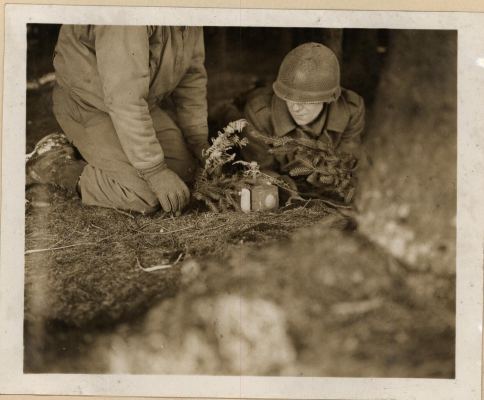
AMERICAN M-3's WERE STAKED AND WIRED DOWN AND CAMOUFLAGED.