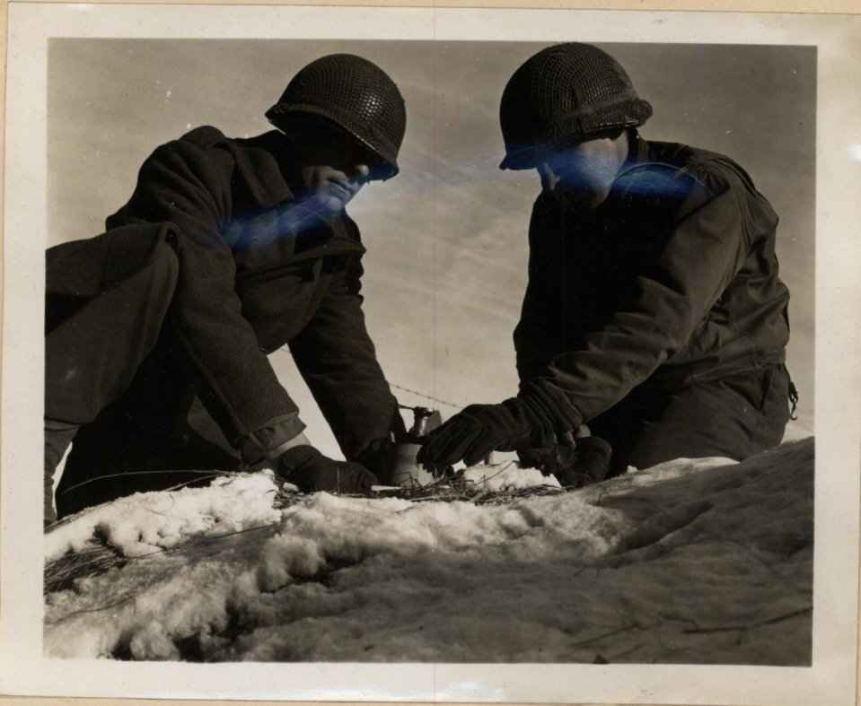
30TH DIVISION SECTOR: NORTH OF MALMEDY, BELGIUM. "A" COMPANY LAYS A LARGE AP MINEFIELD AS PART OF V CORPS BARRIER PLAN. BRITISH SHRAPNEL MINES WERE BURIED IN FROZEN GROUND.